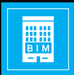
Building Information Modelling